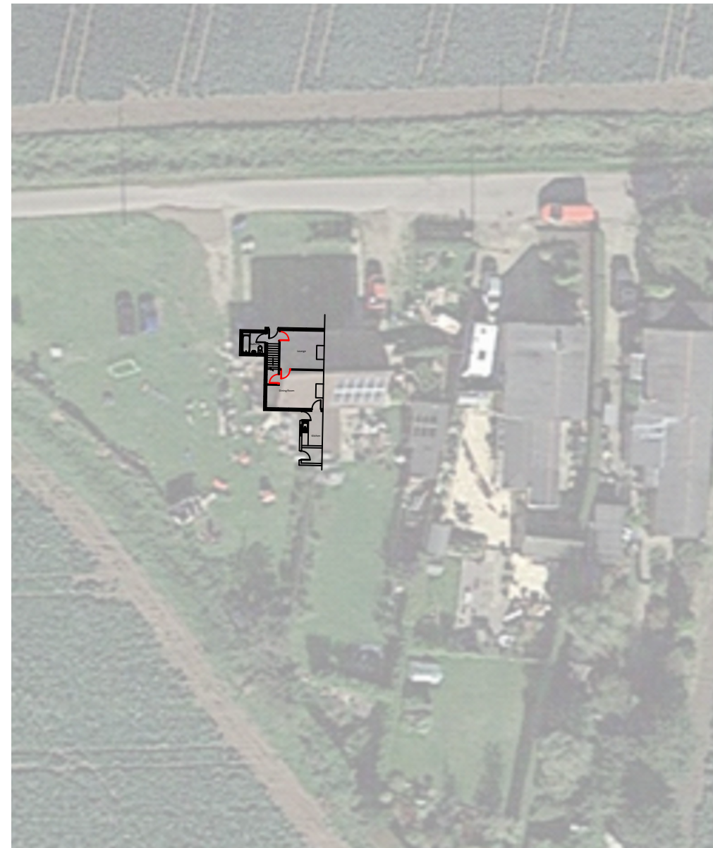
Aerial Site Block Plan 1:500